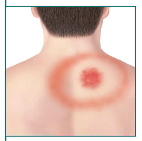
Bull's eye rash.